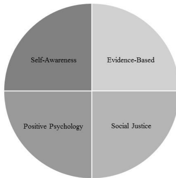
Focus of Training

The four components of our training model are discussed below: