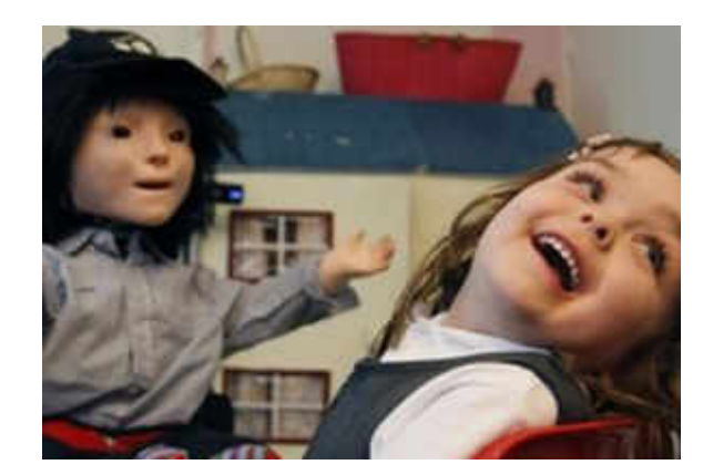
Young girl playing with KASPAR