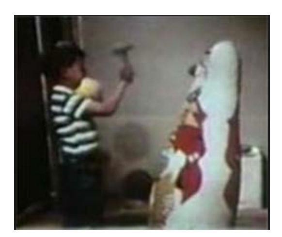
Child hitting a Bobo doll with a hammer after watching an aggressive adult model (Bandura, 1961)

conducted the well-known Bobo doll experiments, in which typical children were recorded interacting with an inflatable doll. Children who observed adults interacting with the doll in a violent manner (e.g., hitting, kicking, throwing) were more likely to perform those behaviors on the doll. Additionally, Bandura demonstrated that observers will emulate an observed behavior even without the presence of a reinforcer and generalize to other violent behaviors and other environments (Bandura, 1977).