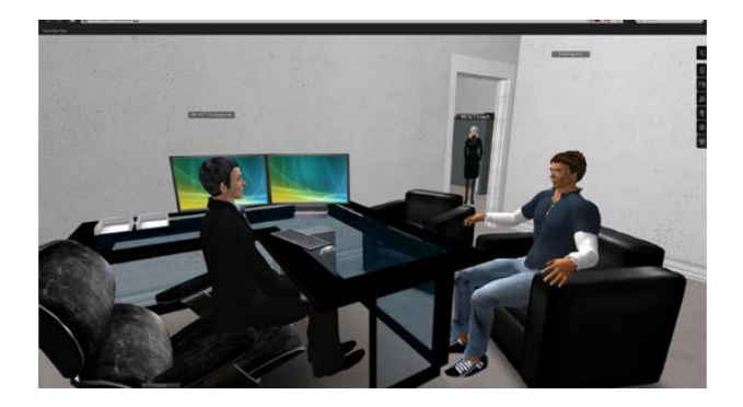
Client, coach, and confederate therapists in virtual reality Social Cognition Training program

cognition refers to an individual's ability to recognize, decode, and respond to social cues. Treatment consisted of virtual scenarios mimicking social situations common for youth in the transition age group (age 17-22). Eight participants went through the scenario once with a coach avatar, operated by a therapist. Following this preliminary attempt, the participant receives performance feedback and repeats the same scenario with an unfamiliar therapist avatar. Results of the study found significant increases in verbal and non-verbal measures of emotion recognition as well as Theory of Mind.